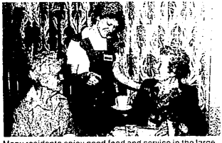
Many residents enjoy good food and service in the large, lovely dining room. Another great option is professional housekeeping.