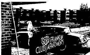
Life is free of worries at Franklin Club Apartments, where the rent includes professional security and 24-hour emergency services.