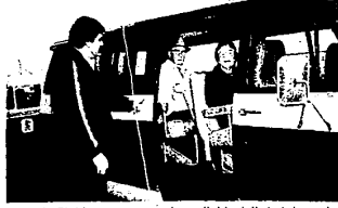
Franklin Club's courtesy van is available daily to take residents shopping and dining, as well as medical appointments.

Our luxurious one and two-bedroom fully carpeted apartments start from only $495 a month, including kitchens and all utilities. Our residents enjoy a full calendar of special events: Catholic, Protestant and Jewish worship services; numerous amenities such as a library, billiards room, community lounge, card room, theatre, exercise salon, and beauty and barber shop. Franklin Club is an adult apartment complex for active people. It is not a nursing home. We would like to tell you more about the benefits of living at Franklin Club Apartments. Be our guest for lunch or dinner. Don't miss out. Only a few apartments are still available.