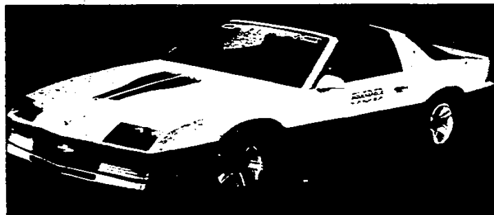
Specially prepared silver-and-blue Z28 Camaro is powered by a 5.0-liter fuel-injected V-8 engine. Similar cars will be available to private buyers.

Camaro — in its various new forms for 1982 — is designed to appeal to drivers from the sports-minded to the more economy-oriented buyer. Three models comprise the lineup: A Sport Coupe, a luxury Berlinetta and a high-performance Z28. All Camaros have recessed dual rectangular headlamps and a fast-back silhouette that