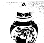
8. Imari Temple Jar