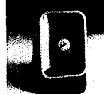
13. Woman's Timex Watch