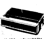
19. GE Space Saver AM/FM Clock Radio