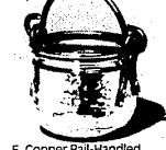
5. Copper Bail-Handled Planter