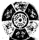
3. Imari 6" Plate with Stand