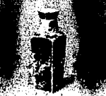
17. Imari Vase