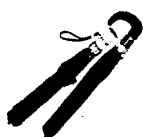
1. Man's or Woman's Umbrella