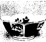
9. Imari Lotus Bowl