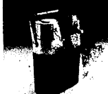
4. Twin Pump Pot