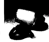
7. Quartz Trouble Spotlight