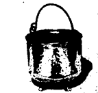
15. Copper Claw-Footed Planter with Bail Handle