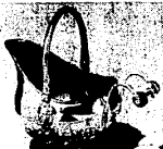
10. Copper Mini Helmet Hod