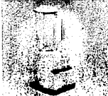
16. Waring 7-Speed Blender