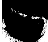
11. Linen Barrel Bag