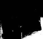
12. Llama Barrel Bag