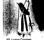
20. Large Copper Umbrella Stand