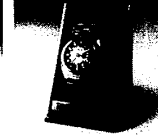
14. Man's Timex Watch