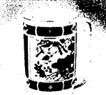
2. Imari Cup