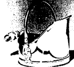
6. Copper English Mini Hod