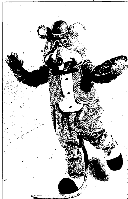
Chuck E. Cheese, "The Big C," is star entertainer of the Pizza Time Players.