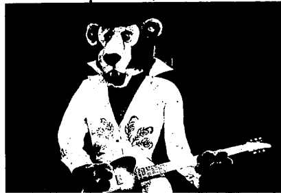
The king of the jungle is Elvis, too.

Don't be surprised if 1982 is called the Year of the Rat.