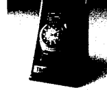
14. Man's Timex Watch