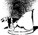
6. Copper English Mini Hod