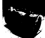
11. Linen Barrel Bag