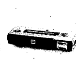
18. Kodak Stylelight Camera