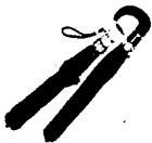
1. Man's or Woman's Umbrella