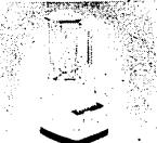
16. Waring 7-Speed Blender