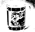
2. Imari Cup