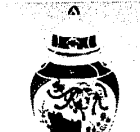
8. Imari Temple Jar