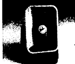
13. Woman's Timex Watch