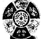
3. Imari 6" Plate with Stand