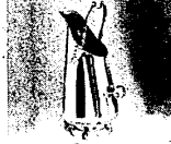
20. Large Copper Umbrella Stand