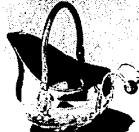
10. Copper Mini Helmet Hod