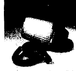
7. Quartz Trouble Spotlight