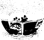
9. Imari Lotus Bowl