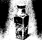
17. Imari Vase