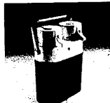
4. Twin Pump Pot