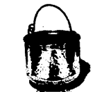
15. Copper Claw-Footed Planter with Ball Handle