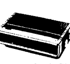
19. GE Space Saver AM/FM Clock Radio