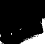
12. Llama Barrel Bag