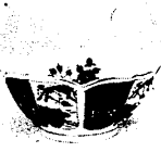
9. Imari Lotus Bowl