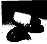
7. Quartz Trouble Spotlight