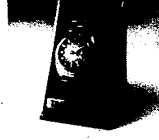
14. Man's Timex Watch