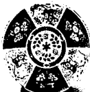
3. Imari 6" Plate with Stand