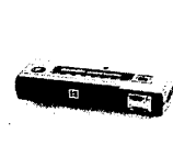
18. Kodak Stylelight Camera