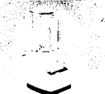
16. Waring 7-Speed Blender