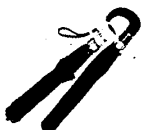
1. Man's or Woman's Umbrella