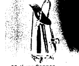
20. Large Copper Umbrella Stand