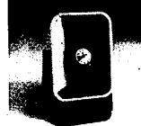
13. Woman's Timex Watch