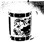
2. Imari Cup