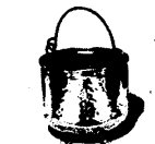
15. Copper Claw-Footed Planter with Bail Handle