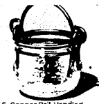
5. Copper Bail-Handled Planter