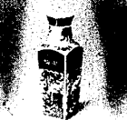
17. Imari Vase