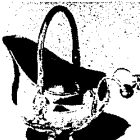
10. Copper Mini Helmet Hod