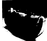
11. Linen Barrel Bag