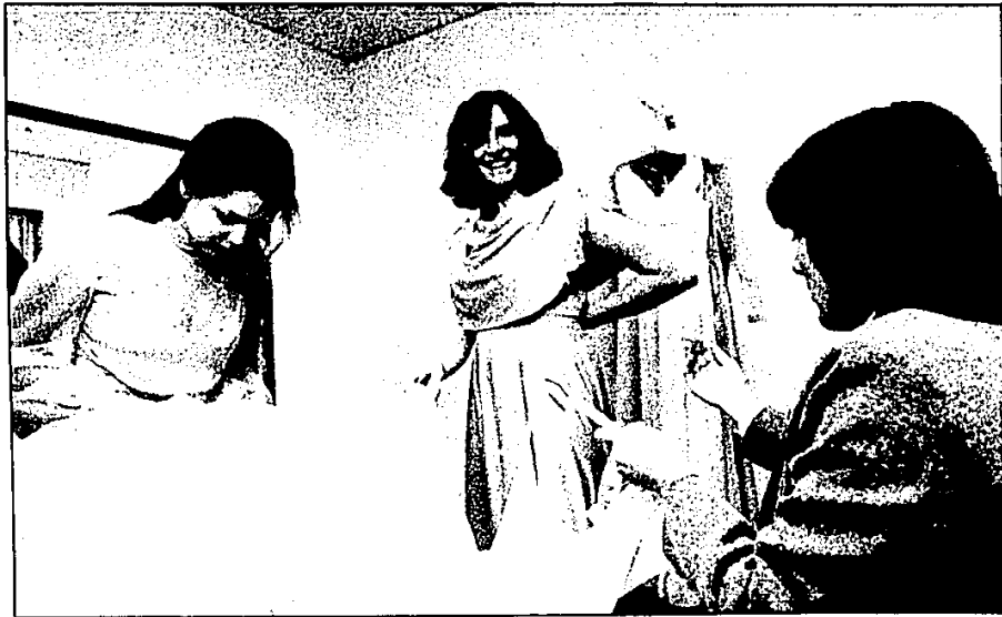
While shopping for bridesmaids' dresses, one of the big factors is choosing just the right shade of yellow. Color swatches help in the selection.