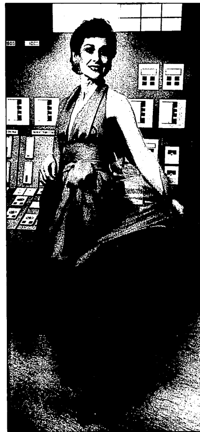
Halter dressing takes on a new look with this two-piece silk chiffon petal designed dress by Tarquin. Available at Claire Pearone, Somerset Mall.