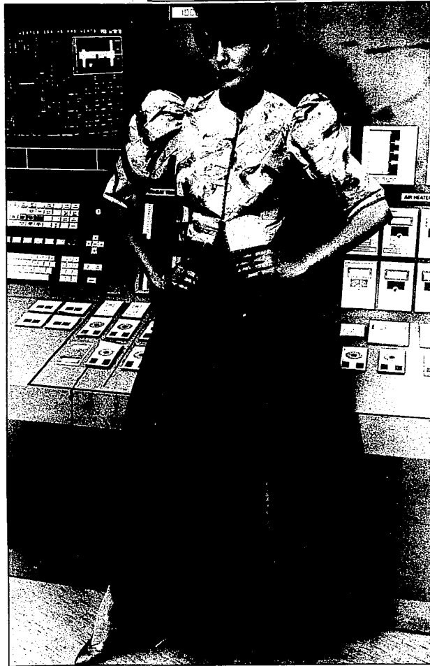
Split skirt dressing will be worn everywhere this season. This hand-painted silk taffeta bolero jacket by Fabrice tops a layered silk split skirt. It's worn with a sash and gold snakeskin pump by Maud Frizon. Available at Hattie, Birmingham.

"There will be a lot of silks in all variations of pants, from the long pant to culottes and short skirts," she said.