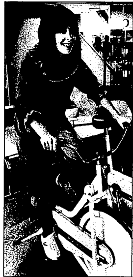
It used to be that sweat suits were only worn during heavy workouts, but not anymore. This knicker outfit can be worn just about anywhere. Available at The Stadium, Hunter's Square.