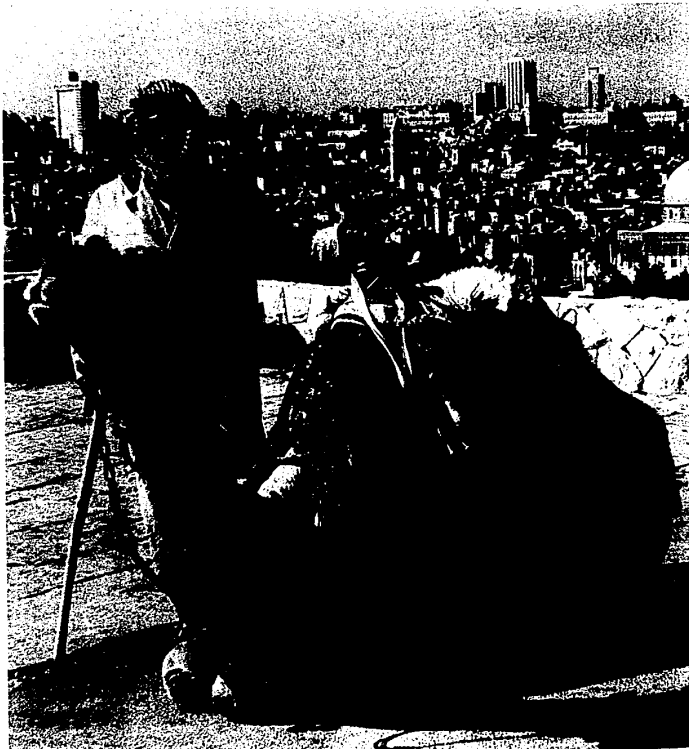
A look at Jerusalem today from the Mountain of Olives.

We all have a lot to learn from Marco Polo.