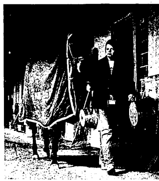
UP AT SUNRISE start the day's chores. That's the story of the Detroit Race Course these days with more than 300 horses bedded down awaiting the opening program on April 20. (Left) This exercise boy is out on the track before the sun comes up. (Right) A girl groom walks a horse to cool it off after a brisk drill.