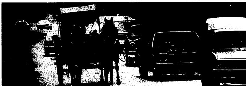
Surreys drawn by quarter-horses shared the road with motor vehicles Saturday during the festivities.