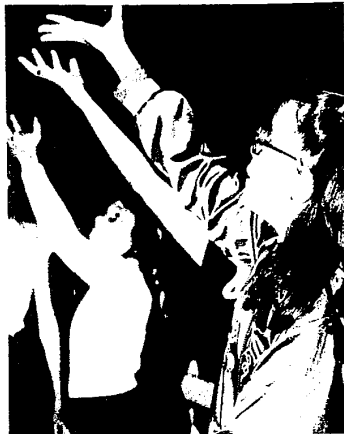
Youngsters in the beginning theater program at OCC practice their movements.