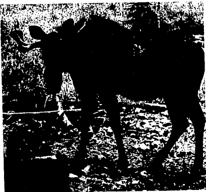
MICKY JONES A young moose grazes beside the Trans-Canada Highway a few miles west of Lake Louise.

Telephone ViaRail at 963-6037 in Detroit. You can buy tickets through Amtrak if you wish. You can board in Detroit, but train lovers in the know drive across the border and catch the train in Windsor.