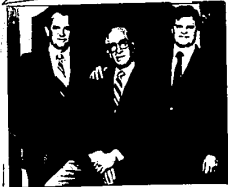
Our Family Serving Your Family