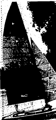
A one-week trip to Barbados (above) through a late booking club is available for $250 from Toronto.