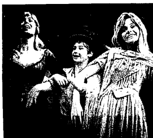
OLIVER — The Academy Award winning musical is currently showing in the Mai Kai and the State-Wayne Theaters. Shani Wallis, Mark Lester and Shelia White appear in this scene.