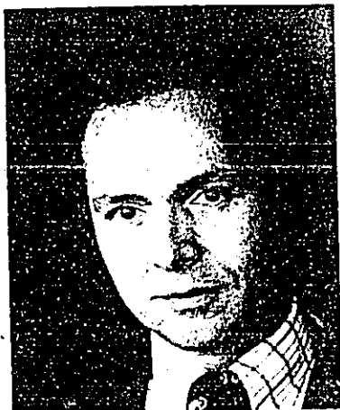
SENATOR JACK FAXON