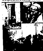
Working in Photojournalism BY TONY SPINA

ON ASSIGNMENT: Projects in Photojournalism