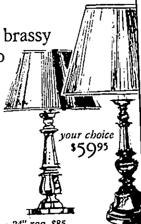
24" reg. $85