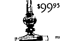
57" with glass tray reg. $150

Bright n' brassy savings to light up your living