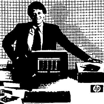
HP 125 Personal Computer System

you can't beat a Hewlett-Packard personal computing system from Ulrich's.