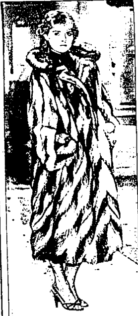
Full length, fully let out Scandinavian Fitch coat from the Gervais collection as seen on Channel 9, 10pm news. Full length Fitch coats from $4,500 Canadian Funds

DUTY & SALES TAX REFUNDED RATE OF PRESENT EXCHANGE 22% One of Canada's Largest Collectors in Mink Coats. Specialists in Restyling Mink.