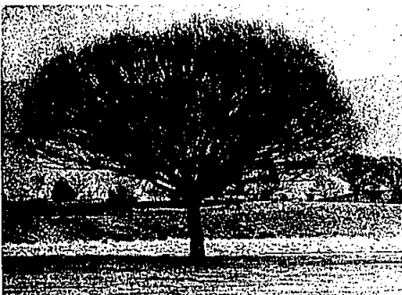
A globe willow tree's bare branches offer a startling view of nature's symmetry in this Monte Nagler photo.