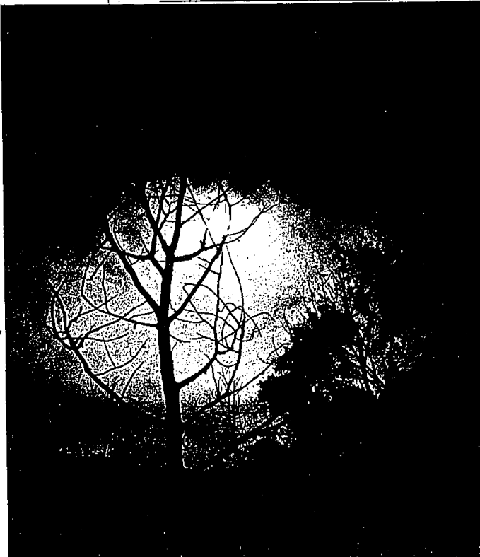
A dramatic sunset was given more intensity when Monte Nagler shot it using a leafless tree in the foreground.