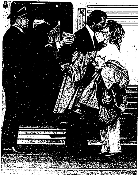
Married after living and working together for years, scriptwriters Burt Reynolds and Goldie Hawn leave on an Amtrak honeymoon that helps put an speedy end to marital bills.