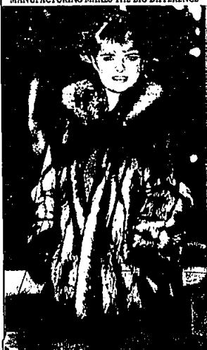
Illustrated: Fitch Jacket

BADGER • STONE MARTIN • FITCH SABLE • MINK • CHINCHILLA