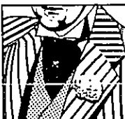
Diamond Jim Brady's

For some of the finest food and spirits in Southfield