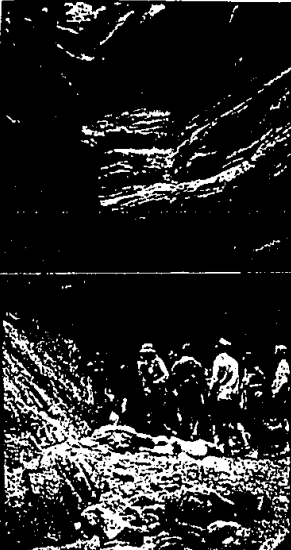
A tour of the Colorado River and Grand Canyon includes sights which leave the average visitor filled with awe. The trip is a geologist's dream as well as a sportsman's challenge.