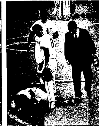
his teammates rush out to revive him. He was able to resume his position behind the plate and finish the game.