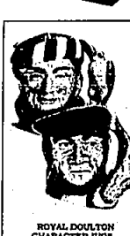
ROYAL DOULTON CHARACTER JUG... Meticulously hand-painted, fa- mous the world-over. All from the pages of history. Sale $60.00.