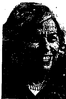
Lt. Gov. Martha Griffiths old folks vote

"The sales tax would have reached the money that would never be reached otherwise. It would get the drug money."