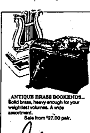
ANTIQUE BRASS BOOKENDS... Solid brass, heavy enough for your weightiest volumes. A wide assortment. Sale from $27.00 pair.