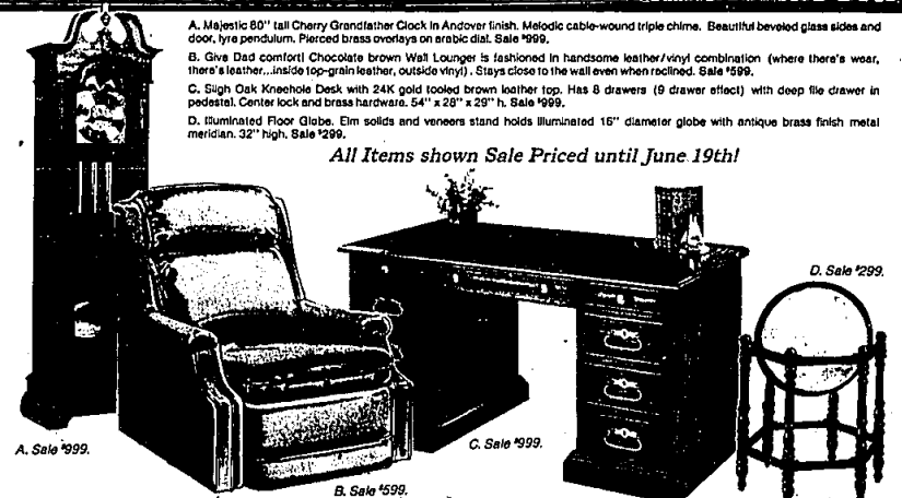
A. Sale $999.