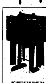
SCHEERER TV TABLES So handy and attractive. Offered exclusive finish in sets of 4, with storage stand. Sale $118.