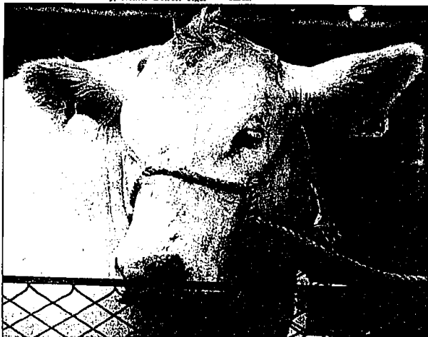
Two of the items up for auction at Great Oaks Country Club were a bull and a steer. The two hefty items combined drew in $5,200 for the charity.

St. Jude Children's Research Hospital, in Memphis, Tenn., is non-sectarian, interracial and free of charge to patients admitted by physician referral. It is dedicated to medical research and care of children stricken with catastrophic diseases.