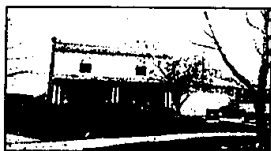
SOUTHFIELD CUSTOM COLONIAL • FOUR Bedrooms, Formal Dining Room. • Walked Floorplan Family Room. • Kitchen with built-ins and breakfast room. • LARGE WOODED LOT, 2 car Garage. • A Real Beauty at $84,000 557-8700