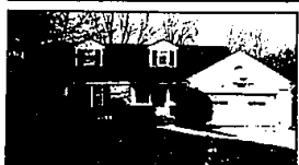
COMPLETELY REMODELED • Lovely three bedroom ranch • Large lot with many trees • First floor laundry, 1 1/2 baths • Family room, fireplace, more! • $82,900 643-8500