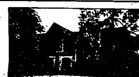
PALMER WOODS — DETROIT • All Brick Tudor-Move-in Condition. • Four Bedrooms, 4 1/2 baths, Library, Central Air. • Family Room, Rec. Room, Inground Pool. • 3/4 ACRE Corner Property. • Highly Desirable. $169,000 557-8700