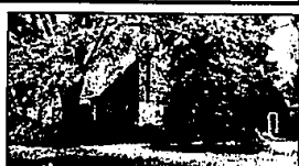
SPACIOUS AND RUSTIC • Private wooded lot • 3 separate bedroom areas • Great Room • First floor laundry • $144,900 540-6777