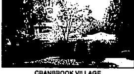
CRANBROOK VILLAGE • Quality Three Bedroom home. • Maintenance Free Exterior, CA. • Sprinkling system, Huge Block Patio. • Professionally landscaped yard. • Land Contract $76,700 557-8700