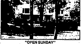
"OPEN SUNDAY" IN-TOWN CAPE COD • Quality family home, superb condition • Four bedrooms, library, many features • Separate dining room • Enjoy a leisurely tour • $134,900 Call 540-6777