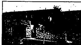
SOUTHFIELD TOWNHOUSE • DELUXE 3 Bedroom, 2 1/2 bath Unit. • Gourmet Kitchen overlooks private courtyard. • POOL, TENNIS, CLUBHOUSE. • L.C./FHA/VA or ASSUMPTION. • Fantastic Location - $82,500 557-8700

source, has developed a special interest in working with steel.