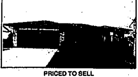
PRICED TO SELL • Clean three bedroom ranch • Desirable area of Troy • 2 1/2 baths, 1st floor laundry • Extra deep lot, 2 car garage. • $83,900 643-8500