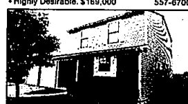
SUPER CONDO • Large three bedroom Condo in Troy • Living room with glass door fireplace • 1 1/2 baths, Central Air, humidifier • Brick patio, attached garage and more! • $83,900 643-8500