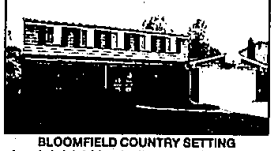
BLOOMFIELD COUNTRY SETTING • Lovely brick tri-level w/two natural fireplaces • 2 1/2 baths, family room • Formal dining, 2 1/2 car garage attached • $117,500 Call 547-2000