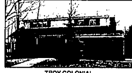
TROY COLONIAL • Four bedroom plus Colonial • King size bedrooms • 2 1/2 plus baths, 1st floor laundry • Family room, fireplace, patio • $118,000 643-8500