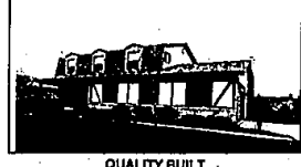
QUALITY BUILT • Newly listed four bedroom Colonial • Large living and dining rooms • Family room with fireplace • Cozy breakfast room, Central Air • $110,900 643-8500

SOUTHFIELD/LATHRUP 26840 Southfield Rd. 557-6700