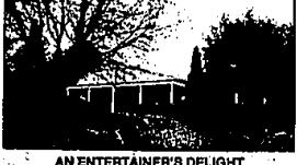
AN ENTERTAINER'S DELIGHT • Spectacular foyer, beautifully decorated • Formal living room for entertaining • Large family room with 2 bayed areas • Picturesque terraced yard w/pool • Call us and See! 540-6777