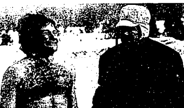
Williams and Walter Matthau both lose their jobs and band together to survive, but the plot's more furious than funny.