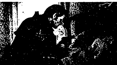
Jerry Reed is an unemployed hitman looking for work who tries armed robbery.