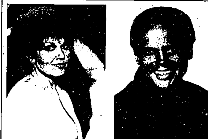
Cleo Laine sings Friday at Meadow Brook, and Harry Belafonte perform Saturday night.