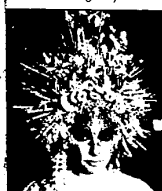
ELIZABETH TAYLOR wears an ancient ceremonial headdress as part of a Kabuki costume during a scene from the film "Boon" now showing in the Quo Vadis theater. Richard Burton and Noel Coward also star in the film, along with Joanna Shimkus and Michael Dunn.