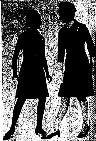
FASHION NEWS FOR GIRL SCOUT LEADERS The first new Girl Scout leader uniform in 20 years is shown above. Created by sportswear designer Stella Sloat, it comes in two versions, one-piece modified A-line with short sleeves and two-piece belted suit featuring three-quarter sleeves. A dress by Miss Emme of New York completes the outfit.