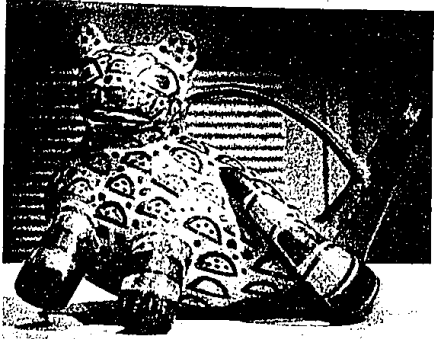
The jaguar-spouted vessel above is from the Ica Valley, Peru, 700-800 A.D. It is one of several excellent pre-Columbian pieces in the show of the same kind of animal. The cylindrical urn at right is Mayan from the El Salvador-Honduras border area, 650-950 A.D. The seated figures are priests. The colors are warm, soft ochers and reds.