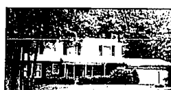
IDEAL FAMILY HOME! Majestic trees shade spacious 4 bedroom Colonial in prime Southfield location. Fireplace, first floor laundry. Land Contract Terms. 626-9100, $77,900.