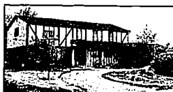
10 YEAR LAND CONTRACT with $35,000 Down at 11%. Circle drive, 2 story foyer, library plus 4 bedrooms, fireplace family room, central air, newly decorated. Backs to park. 626-9100, $124,900.