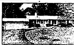
CUSTOM RANCHI Beautiful neutral great room with cathedral ceiling and fireplace highlight impeccably maintained home. Central Vacuum, Intercom, fantastic lower level with wet bar, more! 851-8100, $129,000.

Birmingham Bloomfield Art Association, 1516 S. Cranbrook at 14 Mile.