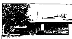
BEAUTIFUL NORTHERN MICHIGAN setting in the City! Over 3 acres frames custom Ranch on private cul-de-sac. Horses allowed! Near 12 Oaks and expressway! Land Contract! 626-9100, $109,900.