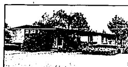
SPECTACULAR LOT with stream frames excellent Frankel built home featuring four bedrooms, central air, sprinkler system, two fireplaces, heated pool too! 626-9100, $119,900.