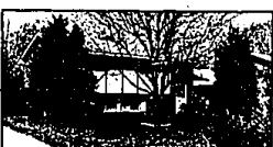
11% LAND CONTRACT, 10 years, $7,000 down! Great for young buyers! 3 bedrooms, country porch, extra shop or garage! 626-9100, $27,900.