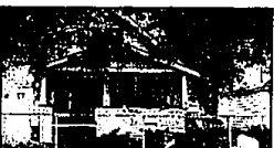
ROCHESTER SCHOOLS! Excellent investment potential in 3 bedroom Ranch on 200' x 1087' lot. Fireplace, 2 car garage. Land Contract Terms. 651-8850, $84,900.