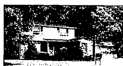
EXCEPTIONAL VALUE! Beautiful brick bi-level in Southfield offers 3 bedrooms, den, 1 1/2 attached garage. Immediate possession. 647-5100, $49,900.