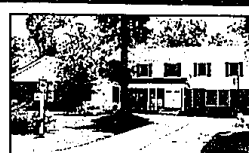
PHOTOGENIC TREED SETTING forms backdrop to stately 4 bedroom Colonial. Includes fireplace family room, hardwood floors, enclosed porch. 626-9100, $93,900.