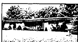
FIVE BEDROOMS POSSIBLE in exceptional brick Ranch at an affordable price! Neutral decor with new carpet, basement, deck too! 648-6000, $69,900.