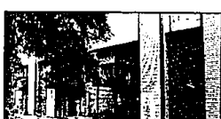
IN EVERGREEN WOODS! Fantastic interior designer decor highlights delightful Ranch Condominium. 2 bedrooms, central air. Land Contract Assumption, $5,000 down. 626-9100, $59,990.