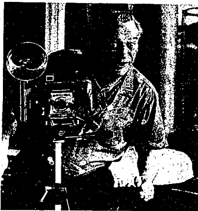
Rodney Dangerfield would drive anyone into a frenzy with his antics in "Easy Money."