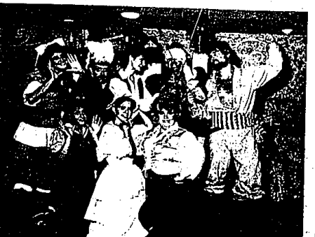
A slapstick version of Gilbert and Sullivan's "The Pirates of Penzance" opens Friday at the Golden Lion dinner theater in Detroit.