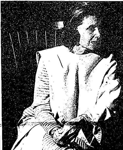
Cyd Charisse, who still takes ballet lessons to keep her weight at 118 pounds, can call up many memories of dancing with Fred Astaire and Gene Kelly.

She also advocated a sensible diet, watching fats and sugars.