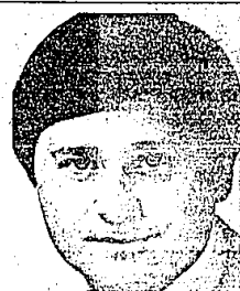
Gov. James J. Blanchard state a 'catalyst'

"Student enrollments are shifting dramatically into areas focused on technology and private sector endeavor," he said. And he downgraded talk that universities need to "downsize" to any great degree, adding, "Wise planning does not dismantle facilities just in time for them again to be needed."