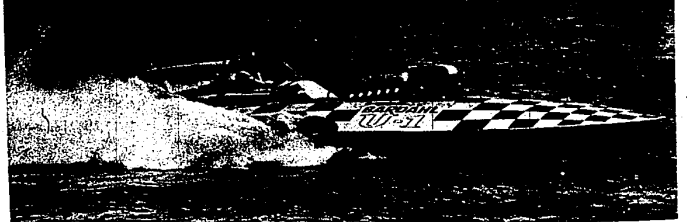
MISS BARDAHL zips across finish line to win championship heat in fatal Gold Cup boat race on Detroit River. The fast-moving hydroplane had lengths to spare on competition in the final lap of the nation's biggest boat race.