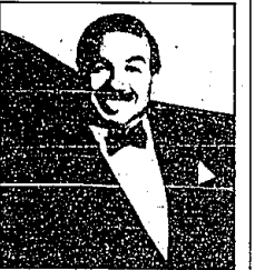
Bobby Short, the premier cabaret performer in America.

If you have a brochure, simply call Teletron at 1 (416) 766-3271 to order.