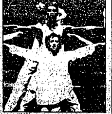
The Hamburg Ballet, Germany's brilliant and greatest company.

symphonique de Montréal, the Salt Lake Mormon Tabernacle Choir, the National Ballet of Canada, the Canadian Opera Company, Froncsyllte Male Voice Choir from Wales, Anton Kuerti, The Toronto Symphony, Pina Bausch, Bobby Short, the Netherlands Chamber Choir,