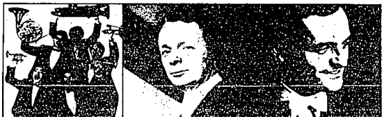
The Canadian Brass, 'One of the world's great ensembles.' Anton Kuerti, 'the world's finest pianist.' Charles Dutoit, MSO's dynamic conductor.

Major artists will include The Hamburg Ballet, Sankai Juku, the Canadian Brass, Supercussion, Maureen Forrester, Orchestra