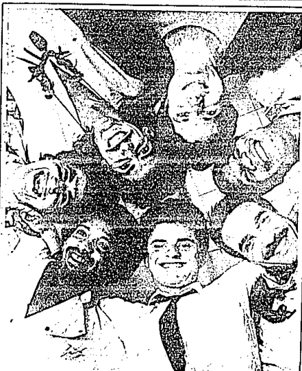
Coconut Groove plays at 8 p.m. Friday, June 15, at the Summer Nights series at the Troy Hilton Inn's Outdoor Courtyard.