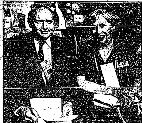
Sen. Carl Levin goes over his speech with Lt. Gov. Martha Griffiths before addressing the Democratic convention on platform issues.

Nevertheless, the platform votes were the part of the convention many program-oriented Michigan Democrats relished most, since the numbers were known well in advance.