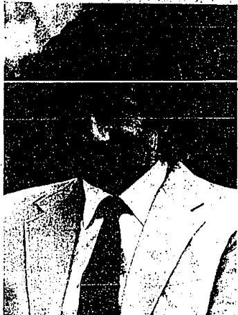
Dudley Moore is an engineer who is unsuccessful at everything in "Best Defense."