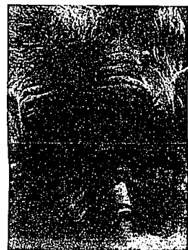
I KNOWS WHAT I LIKES.

Entry Donation - Tax deductible. Checks payable to United States Sports for Israel. (Check must accompany entry application) $50 for a singles player.