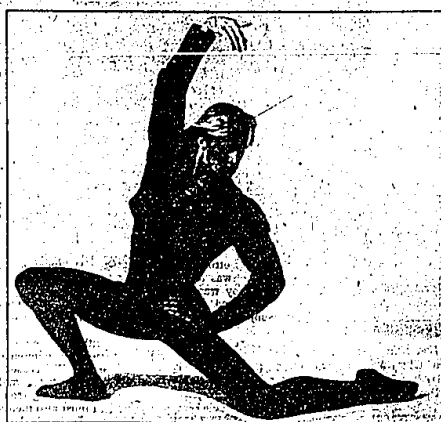
Alexander Goudunov, former star of the Bolshoi Ballet, will give two performances of "An Evening of Alexander Goudunov and Stars" at Music Hall Jan. 24 and 25.

ble, unlikely, continuous," said Trisha Brown, artistic director and choreographer of the Trisha Brown Company.