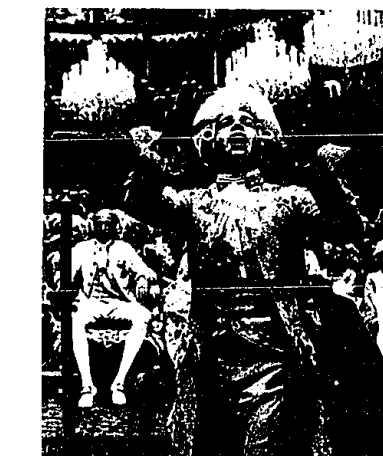
Tom Hulce is Wolfgang Amadeus Mozart in "Amadeus," story of the struggle between the musical genius and a jealous, rival composer.