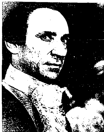
F. Murray Abraham is Antonio Salieri, who devotes his life and music to God but loses his religious faith when he sees how Mozart has been creatively blessed.