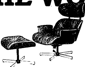
Leather and Walnut Chair and Ottoman Was $799