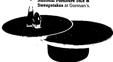
DIA Cocktail Table Was $600

Just think, that search for a new dining room table, couch or coffee table could mean a vacation for two in places like London, Paris or even Madras, India. Right now through October 22nd, at all Gorman's showrooms, you'll save 10-50% on every item in the store* and have the chance to sign-up to win a grand prize vacation for two at any Sheraton hotel in the world every year for the next five years plus $10,000 in solid gold bars. It's the second annual Billion Dollar National Furniture Sale & Sweepstakes at Gorman's.